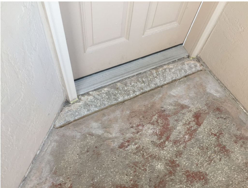
Picture 2: Topping repair at unit entry door prior to concrete placement